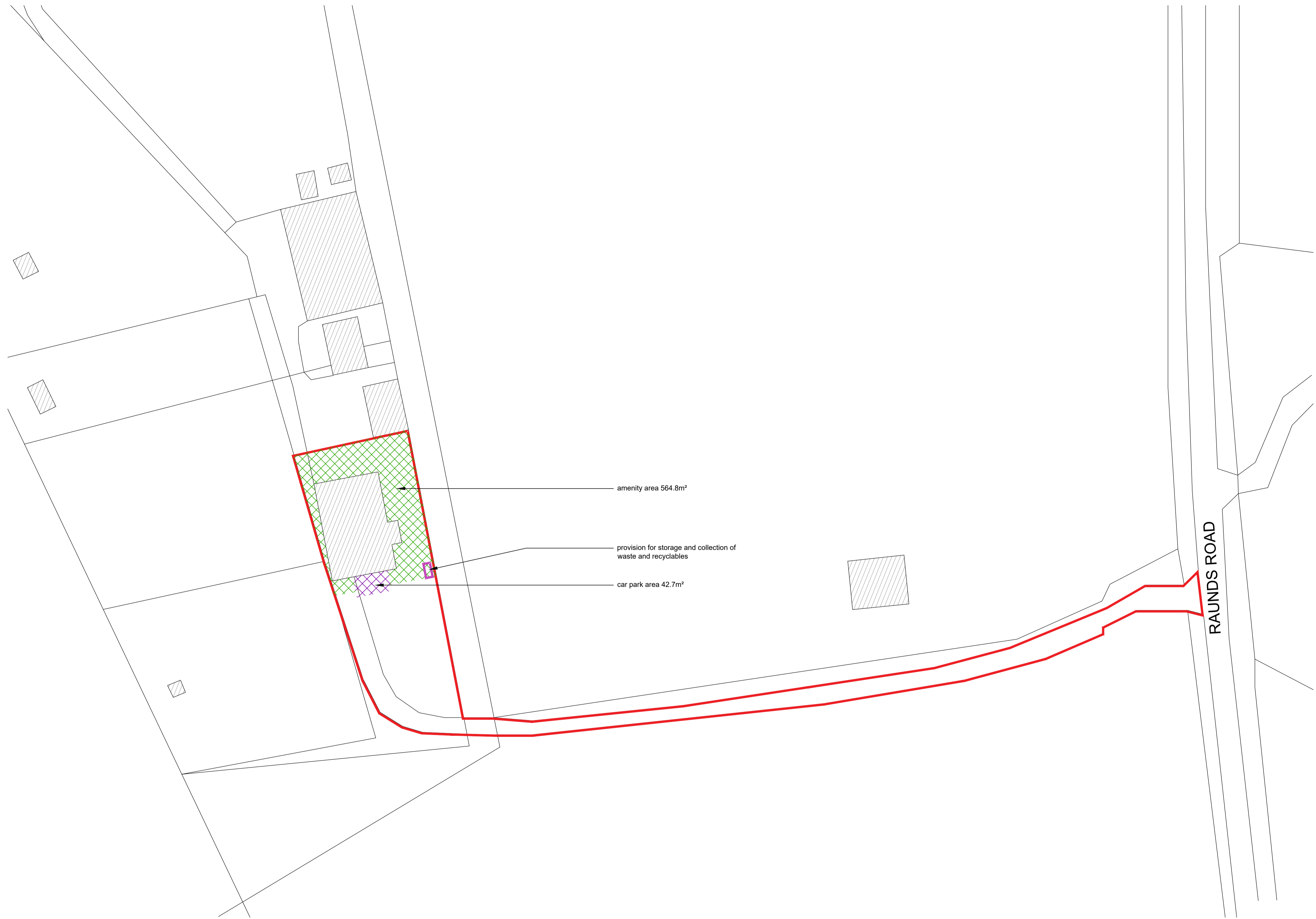
01 Proposed Site Plan PL-01 1:500